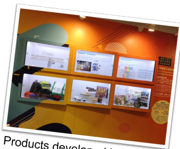
Products developed by the funded ventures were showcased.

Organised by the Golden Age Foundation, GAES aims to foster cross-sector collaboration and drive "smart ageing" in the city.