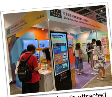
SIE Fund's booth attracted more than 700 visitors.