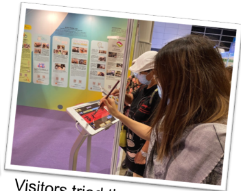
Visitors tried the calligraphy game on NeuroGym App.