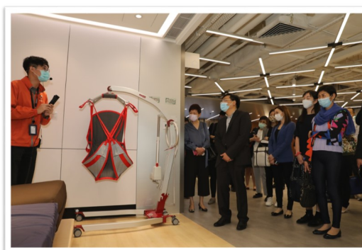
An officer of the centre introduced the "electric foldable hoist" and its use to Task Force members.

On 28 April 2021, the SIE Fund Task Force paid a visit to two service centres operating under the Jockey Club "age at home" Gerontech Education and Rental Service scheme funded by The Hong Kong Jockey Club Charities Trust and administered by The Hong Kong Council of Social Service. At the Jockey Club "age at home" Gerontech Education and Rental Service Centre operated jointly by Hong Kong Red Cross and Evangelical Lutheran Church Social Service – Hong Kong, Task Force members toured the exhibits of gerontech equipment and were briefed on the educational activities and consultancy and equipment rental services. At the Gerontech Cleaning and Maintenance Service Centre operated by St. James' Settlement, members were shown the one-stop services for cleaning, disinfection, quality check, maintenance and re-packaging of rental equipment. The visit enabled the Task Force to keep abreast of the latest development and application of gerontechnology and would benefit the Fund's work of fostering the development of the gerontechnology ecosystem in Hong Kong.