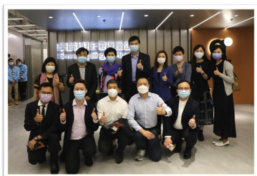
The SIE Fund Task Force paid a visit to two service centres operating under the Jockey Club "age at home" Gerontech Education and Rental Service scheme.