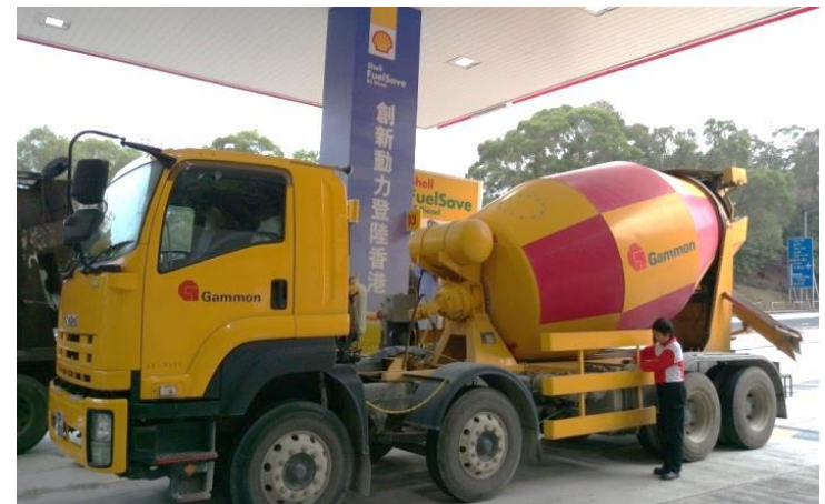
1 st B5 'on the road'

Use in Gammon's own plant and equipment (non JV projects)